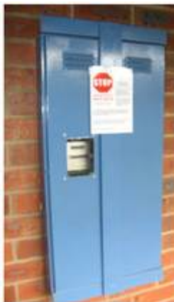
Electricity Meter Protection