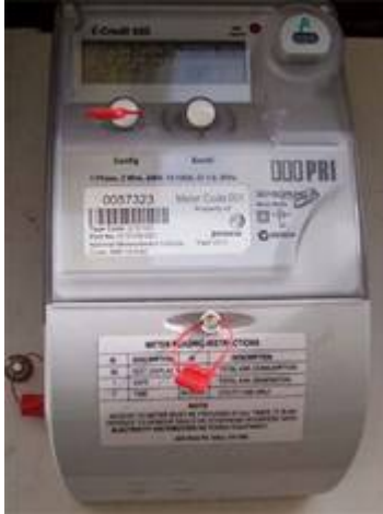
Electricity Smart Meter