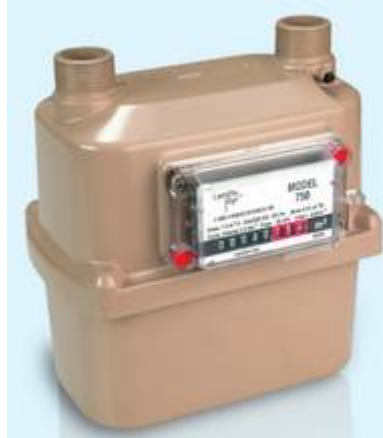
Gas Smart Meter