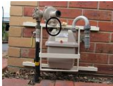
Gas Meter Protection